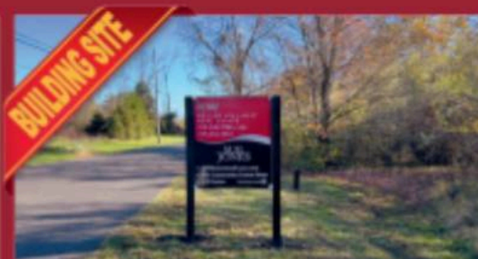
Lot 12 Homestead Lane West Rockhill Township $175,000