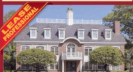
Newtown $10,000 per month