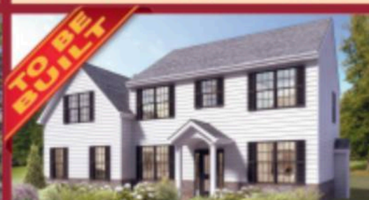
Sellersville 3.29 Acres $920,000