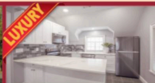
Doylestown Borough Apartments $1,750 - $2,500